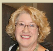
by Pam Crank