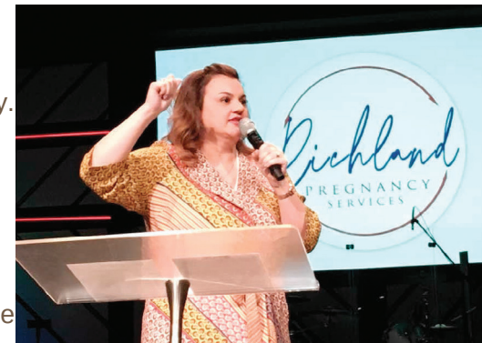
Abby Johnson spoke from her heart about her personal experience with abortion.