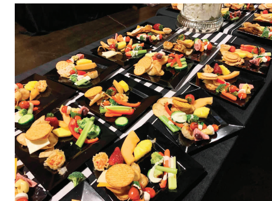
Village Catering served a variety of appetizers prior to the program.